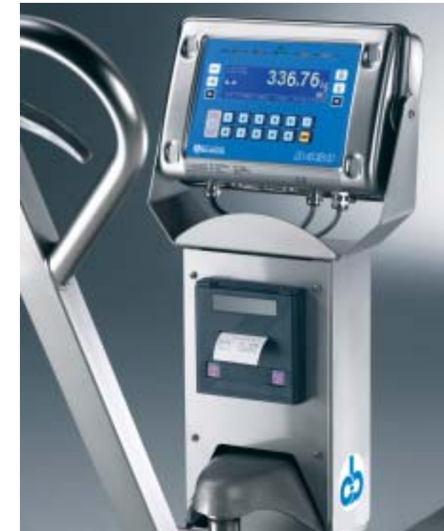
PTM-N IX model with optional printer