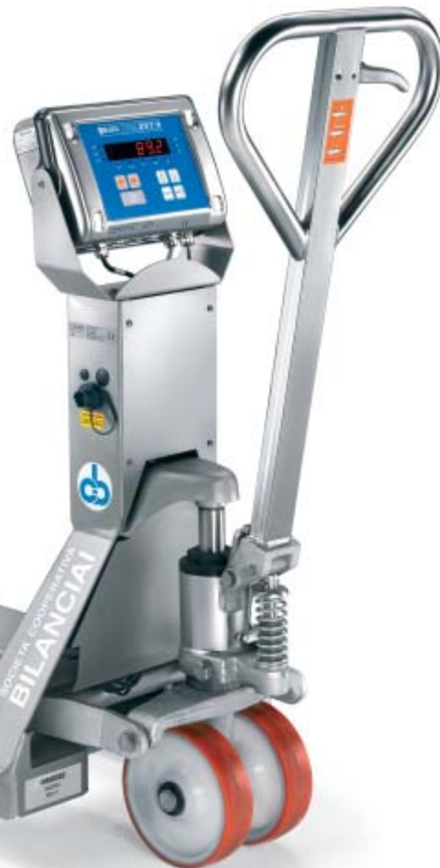
PTM-NE IX model